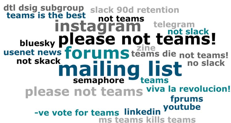
Figure 2: Community input into selection of the online platform

We did not expect that one of the most controversial topics of our launch event would be the choice of our online platform, but it turns out that we have a lot to learn! Our community had some feelings about it.