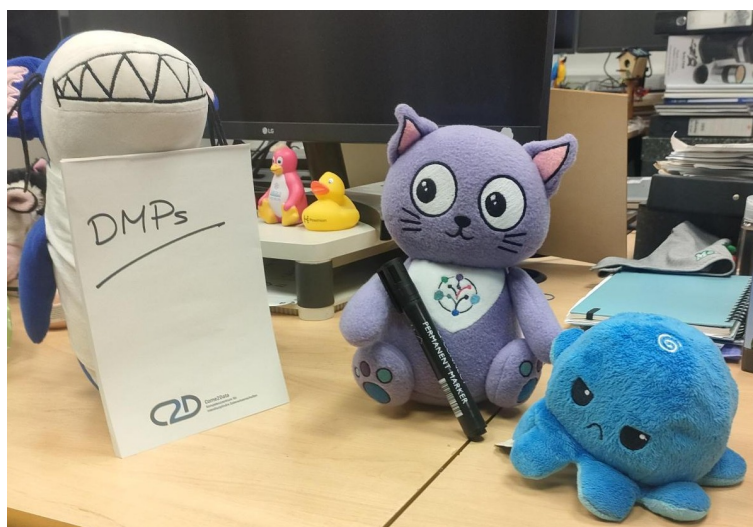
Figure 3: Cassie, with the help of PSDI's Sharkcat, trying to warn Dr. Octopus about the dangers of not creating data inventories

We introduced our brilliant mascot, Cassie, at our launch event on the 18th September 2025 and to say that she was popular was an understatement! We've had requests for more stickers, been emailed questions about her, and she has even made fleeting appearances on CaSDaR's social media .