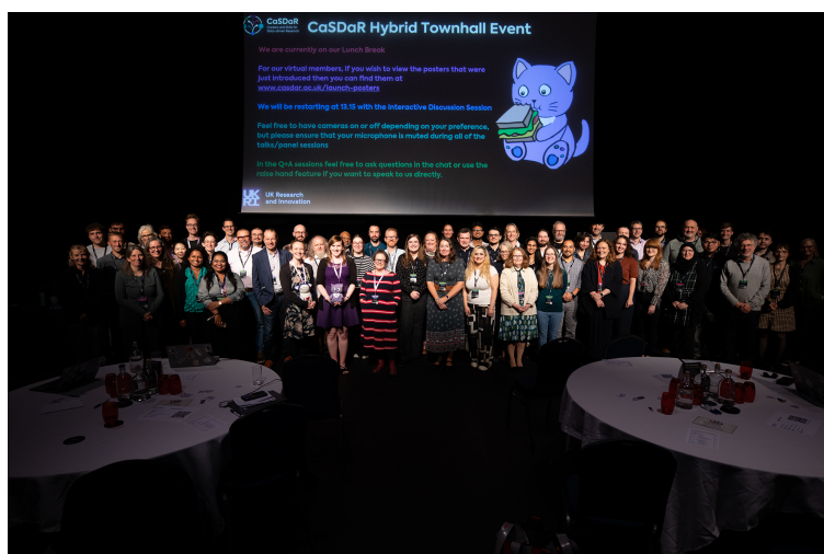
Figure 1: The in-person Townhall attendees

A report of the event, including the event agenda and outcomes of the sessions can be seen here , talk slides and posters are deposited in CaSDaR's zenodo project page , and recordings of the event can be seen in the Townhall Playlist on CaSDaR's YouTube Channel .